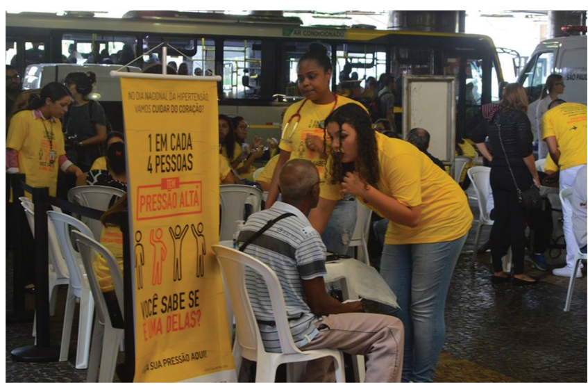
Figure 3. Community hypertension screening held at the Itaquera Metro Station, a major traffic intersection linking a shopping center, a sports stadium, public services, metro and bus station, with a capacity of 60,000 passengers per hour.

time information by one or two years, often provide the primary evidence base for decision-making pertaining to CVD. The Better Hearts Better Cities initiative introduced the systematic tracking of progress and data on hypertension diagnosis, treatment and control rates, for use in real-time (Novartis Foundation 2021, Boch et al. forthcoming). Data collected during the initiative are currently being used by the health authorities in Ulaanbaatar to further investigate the connection between health indicators, urban structures, and environmental and social components.