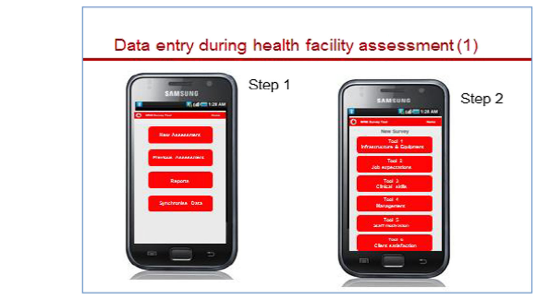
Fig. 1 "Front end" of e-TIQH – start pages