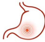
Diarrhea may indicate stomach infection