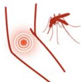
A recurrent fever may indicate malaria

Fever can be diagnosed using a thermometer. Accompanying symptoms can then help the diagnosis, as they can indicate which part of the body may be affected or infected.