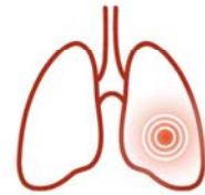
Persistent cough may indicate lung infection

We acknowledge the contributions of partners on the Ghana Telemedicine pilot: Airtel, Earth Institute, Columbia University, Ericsson, Ghana Health Service, the Ghana Ambulance Service, Ministry of Communication, Ministry of Health, and National Health Insurance Agency, MedGate, Millennium Promise Alliance, Novartis Foundation, and St. Martin's Hospital.